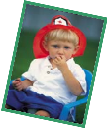
In 2008 Children's Services Division removed over 1,600 Children from Abusive Homes

Three young children were removed from a single mother with mental health concerns. The mother was not taking her prescribed medication. All three children have some type of medical and or developmental diagnosis. The children were placed with their maternal grandmother who allowed them to see their mother weekly. The disruption to the children was minimal, and they were able to stay with a close relative and go to their same schools.